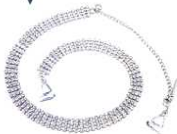
ABOVE: Elite™ Four Strand Crystal bra straps: Adjustable bra straps featuring 344 round brilliant Swarovski crystals per strap. Elegant jewelry box and pouch included. Retail: $45 per pair

Margarita Couture has turned a fashion no-no into a must-have and transforms "Ugly Bra Strap Syndrome™" by concealing dirty bra straps and giving women the confidence to show off those straps! These versatile straps are classy and really accent every woman's attire; true jewelry for your shoulders. All available at www.brastraps.com