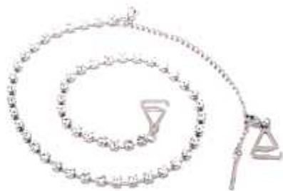
RIGHT: Elite™ Single Strand Crystal bra straps: Adjustable bra straps featuring 70 round brilliant Swarovski crystals per strap. Elegant jewelry box and pouch included. Retail: $35 per pair